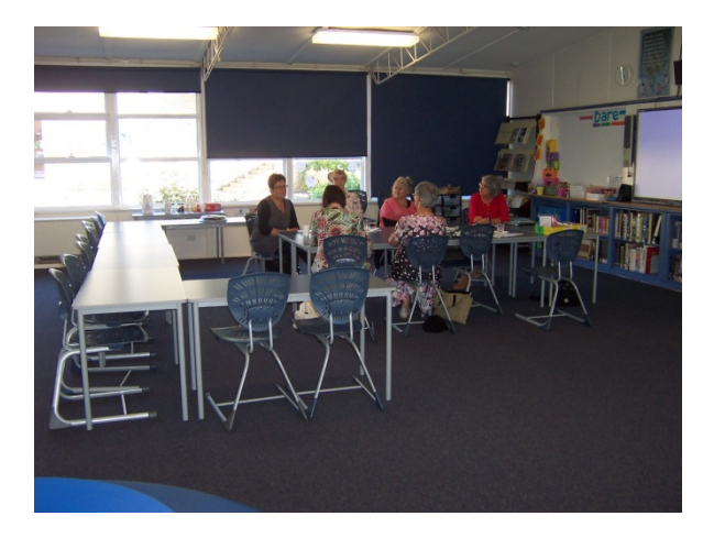
Customs House Gallery, Hawkesdale