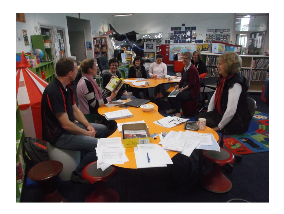
Attendees at SLAV South Western Branch Meeting at St John's Primary School Library September 17