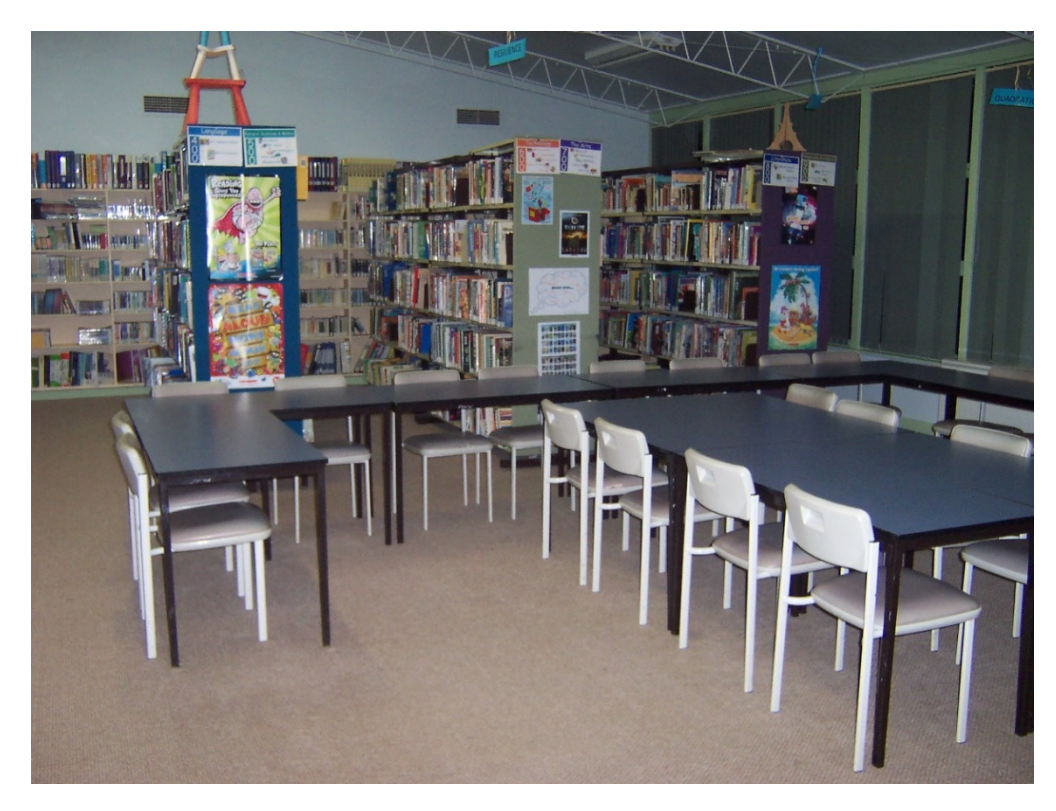
A section of the Heywood and District Secondary College Library