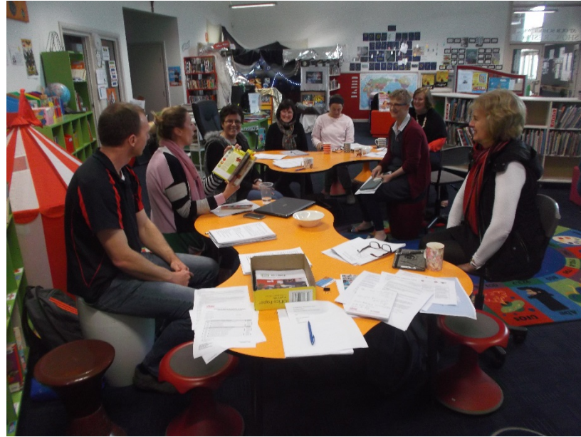
Attendees at SLAV South Western Branch Meeting at St John's Primary School Library September 17