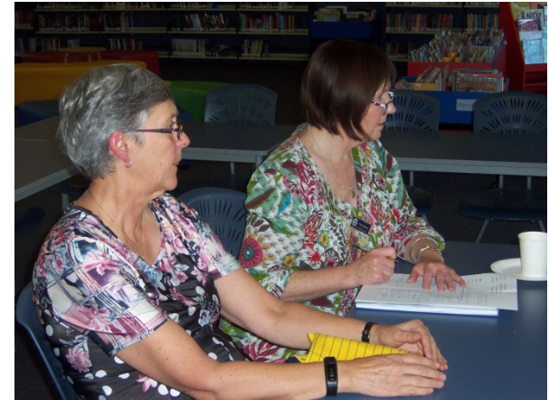
Hawkesdale P 12 Library

For next time we plan to look at Genres. Venue, date and time to be confirmed.