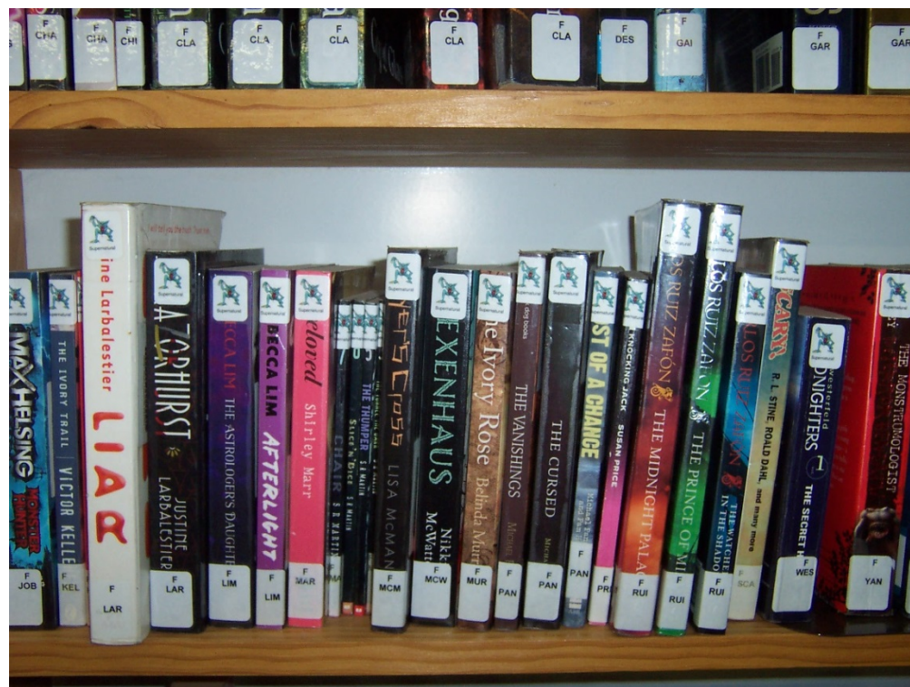
The Supernatural genre section at Heywood and District Secondary College