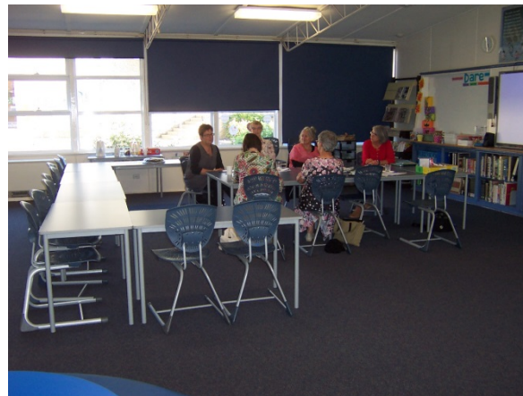
Customs House Gallery, Hawkesdale