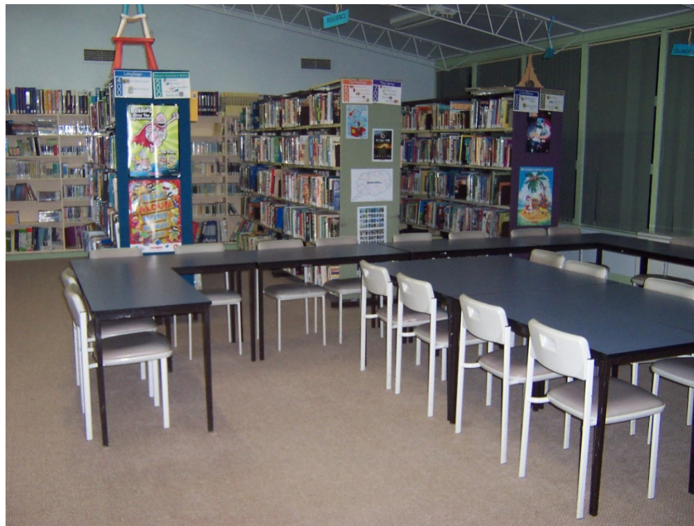
A section of the Heywood and District Secondary College Library

Schools represented at the Branch Meeting were: